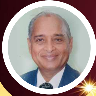
ISSH Basic Hand Course Director