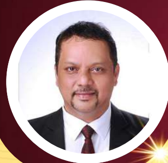
ISSH Basic Hand Course Convener